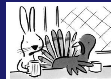
Take the groundhog - now that's a sweet gig."